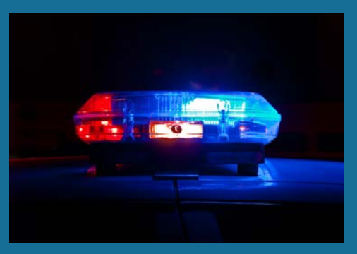
Central Texas Public Safety Commission | Executive Director