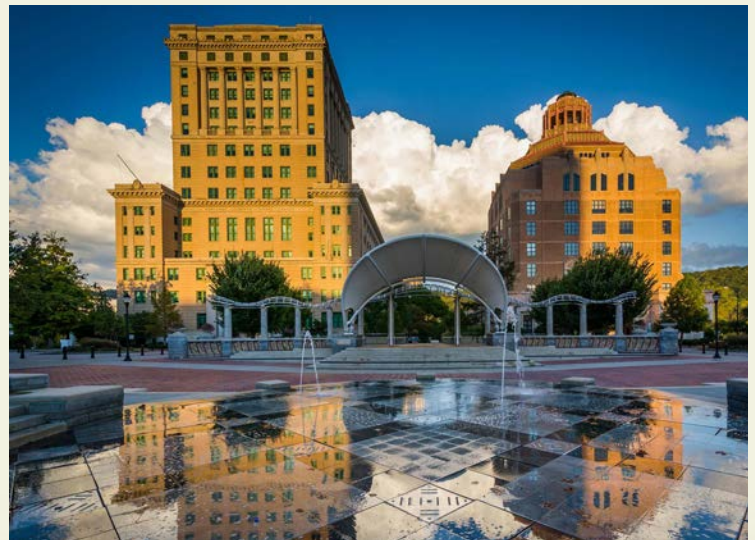
Pack Square Park’s iconic fountains serve as a popular downtown gathering place for residents and visitors of all ages.

One of the Top 50 Places to Travel in 2026